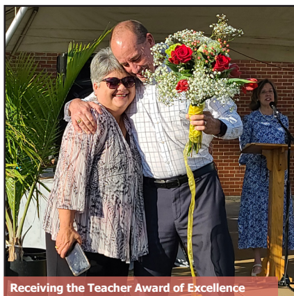
Receiving the Teacher Award of Excellence