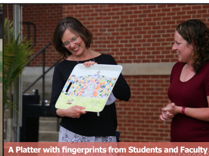
A Platter with fingerprints from Students and Faculty