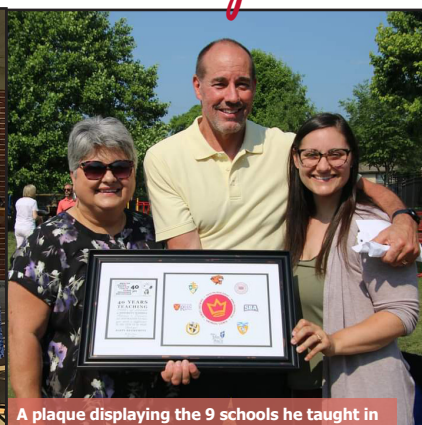
A plaque displaying the 9 schools he taught in