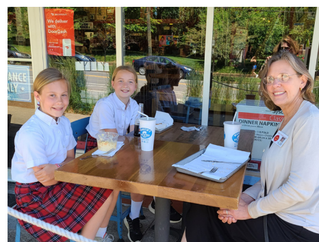
Lunch with the Principal